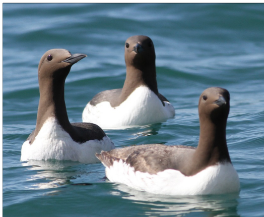
Bateleur: South Africa Guillemot: Dorset Hoopoe: Spain